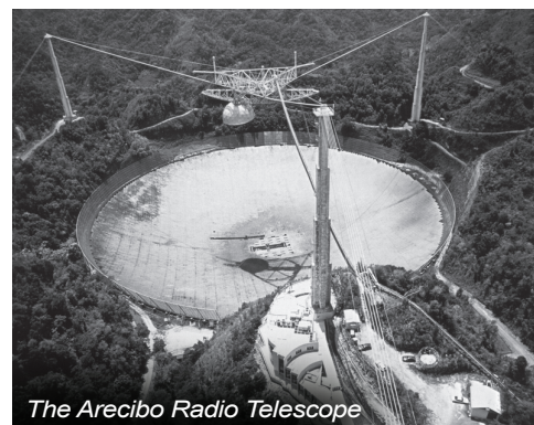
The Arecibo Radio Telescope

For more information call the Kensington Nature Center at 248-685-0603 or visit the GLAAC website at: www.boonhill.net/glaac/